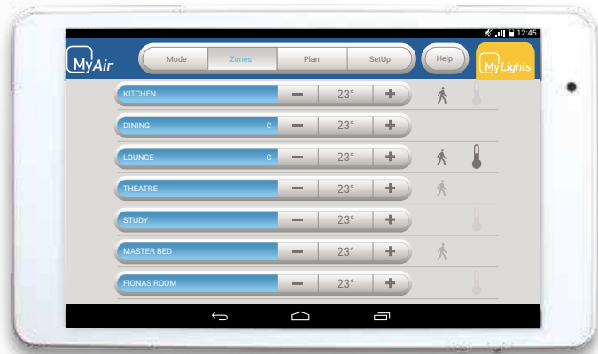
One touch takes you to the zone controls, where you decide how much air goes where.

Like all the best tablets, MyAir Series 5's touch screen is simple and intuitive to use. The entire system is designed to be technophobe-friendly. The home screen displays all your options - simply tap on what you want to do and follow the prompts. For example, when you tap on Zones every room in the house will be displayed. You can then increase or decrease the airflow to any room by tapping the + or - button next to it. Rooms with optional Individual Temperature Control sensors will display temperature while others display airflow %. We've even included a Help button in the unlikely event you need it.