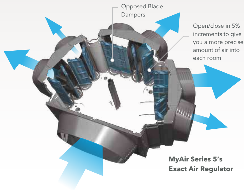
MyAir Series 5's Exact Air Regulator

The Exact Air Regulator rewards you with smoother, quieter, more even airflow, and rewarded Advantage Air with an Australian Design Mark award for innovation.