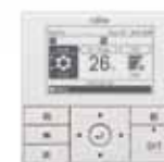
Wired Remote Controller (High grade)