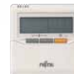
Wired Remote Controller